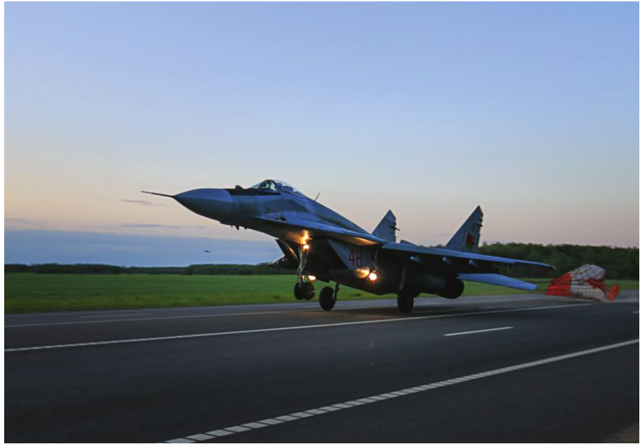
Takeoff of the Belarusian MiG-29 plane on the M4 road on 18 May 2016

up the base could pose in terms of provoking a Russia-West confrontation 9 10 . By now, official Minsk has effectively blocked setting up the airbase 11 , which is confirmed by the absence of statements from Russian official representatives about creation of an additional military facility in Belarus or Minsk's financial investments in their military aviation. It seems that the issue of the Russian military base has now lost its significance. Besides, should it be necessary, Russia can put the base on its own territory in Kaliningrad at less expense.