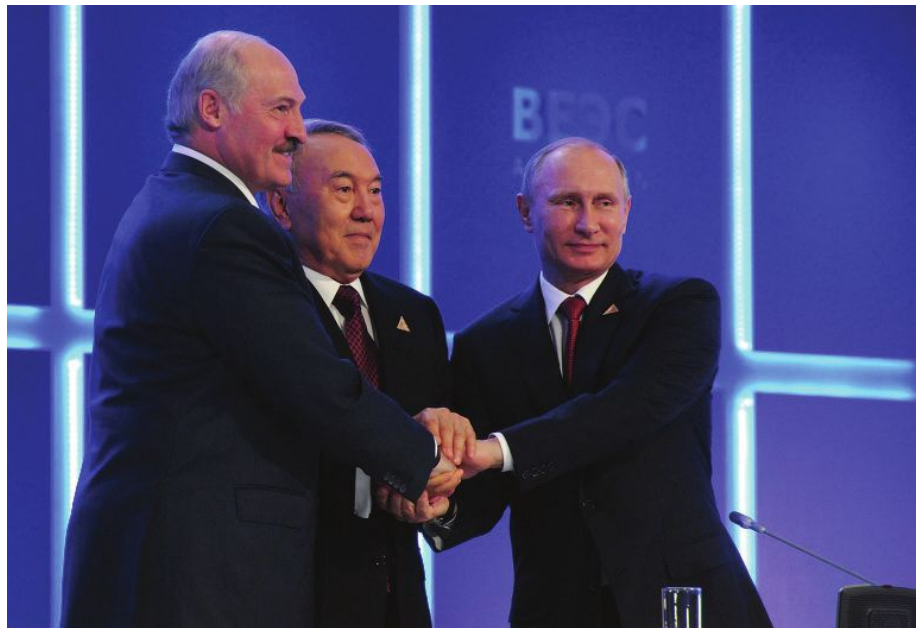
State leaders of Belarus, Kazakhstan and Russia signing the agreement on the creation of the Eurasian Economic Union. 29 May 2014

Belarusian manufacturing has historically been oriented to the Russian market. As a result, the Russian economic crisis and falling hydrocarbon prices on the world market are leading to a deterioration in Belarus' trade balance. In many ways, Russia's economic decay is responsible for the fact that in only its first year of existence, the Eurasian Economic Union's (EEU) became a failure for Belarus.