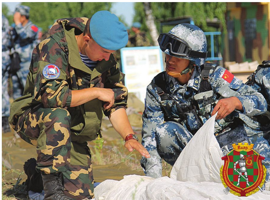
Belarus-China military exercises in June 2015

The joint Shield of the Union exercises in 2015 gathered 1.5 times fewer military personnel than the 2011 Shield of the Union or West-2013 exercises (i.e. 8,000 participants compared with 12,000). While military exercises seemed all but impossible without Russia before, today the Belarusian paratroopers practice with the Chinese every year. Although the scope of such training exercises looks miserly in comparison with the exercises with Russia, it shows Belarus' desire to find new partners. Thus, today, in the opinion of analyst Andrei Paratnikau, Belarus' military dependence on Russia is even less, than, for example, Great Britain's military dependence on the United States 15 .